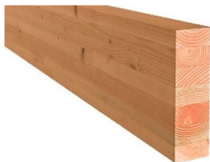
Glue Laminated Timber (Glulam) Beams & columns