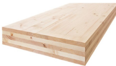
Cross-Laminated Timber (CLT) Solid sawn laminations